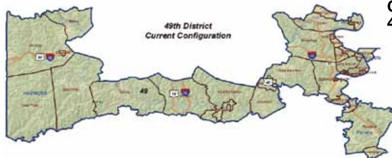
Current 49th District